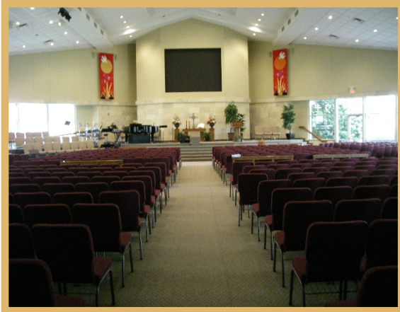
Celebration Hall: seats 700; media/sound booth, presentation screen stage, full service kitchen, adjacent classrooms available

Does your company need a place to train and motivate employees? Does your group need a venue to celebrate your special event? Stonebridge UMC houses three large meeting spaces and several class rooms perfect for corporate training, receptions, special ceremonies and much more.