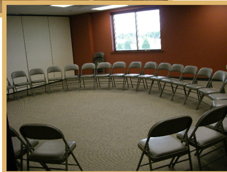
Robertson Activity Center (RAC): seats 700; lobby, sports equipment, presentation screen, media/sound booth, stage, green room, full service kitchen, shower facilities and adjacent classrooms available