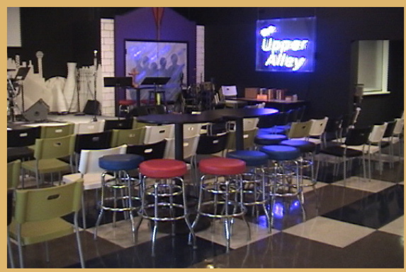
Upper Alley: seats 240; media/sound booth, wireless access, portable stage, kitchen, adjacent classrooms and conference room available